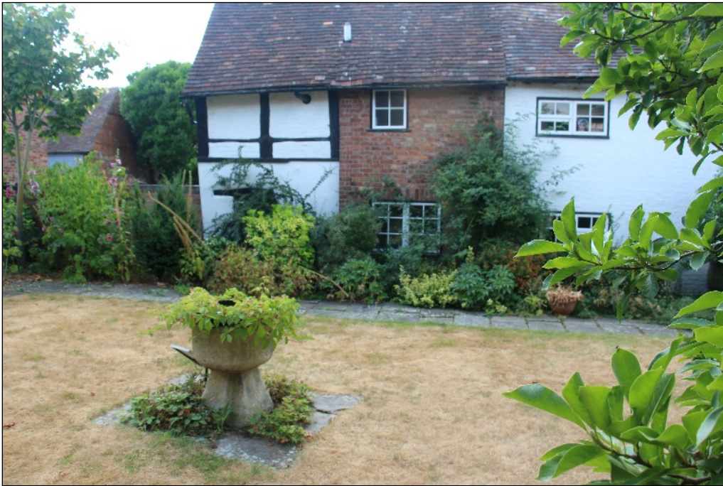
Malvern Meeting House