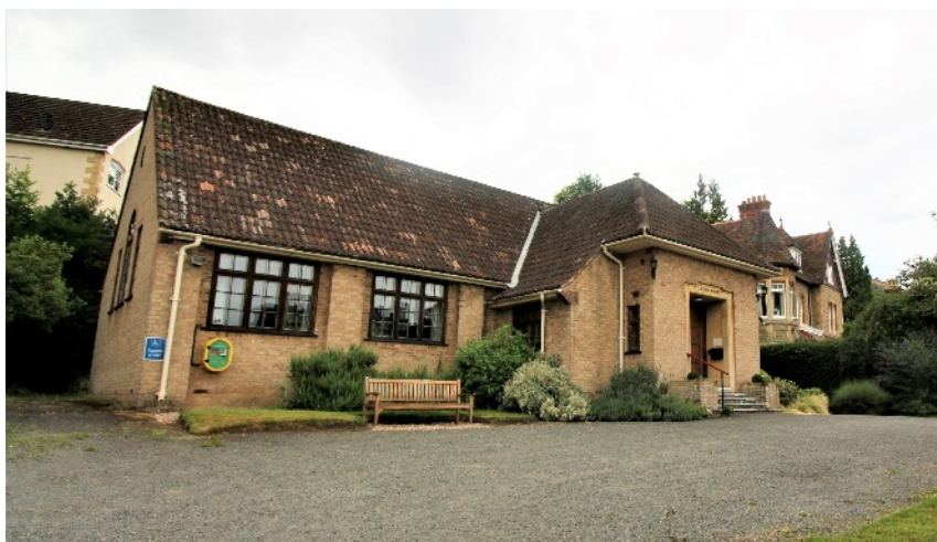
Southern East Anglia Area Quaker Meeting

My eldest great-granddaughter is coming up for her driving-test. I have not accompanied her as I did so many granddaughters, because I do not myself drive now, and we would be in a mess if my learner needed actual help. As before, the females seem to pass their test without trouble but the males are bumptious and fail! Time goes on and it is still all the same thing really.